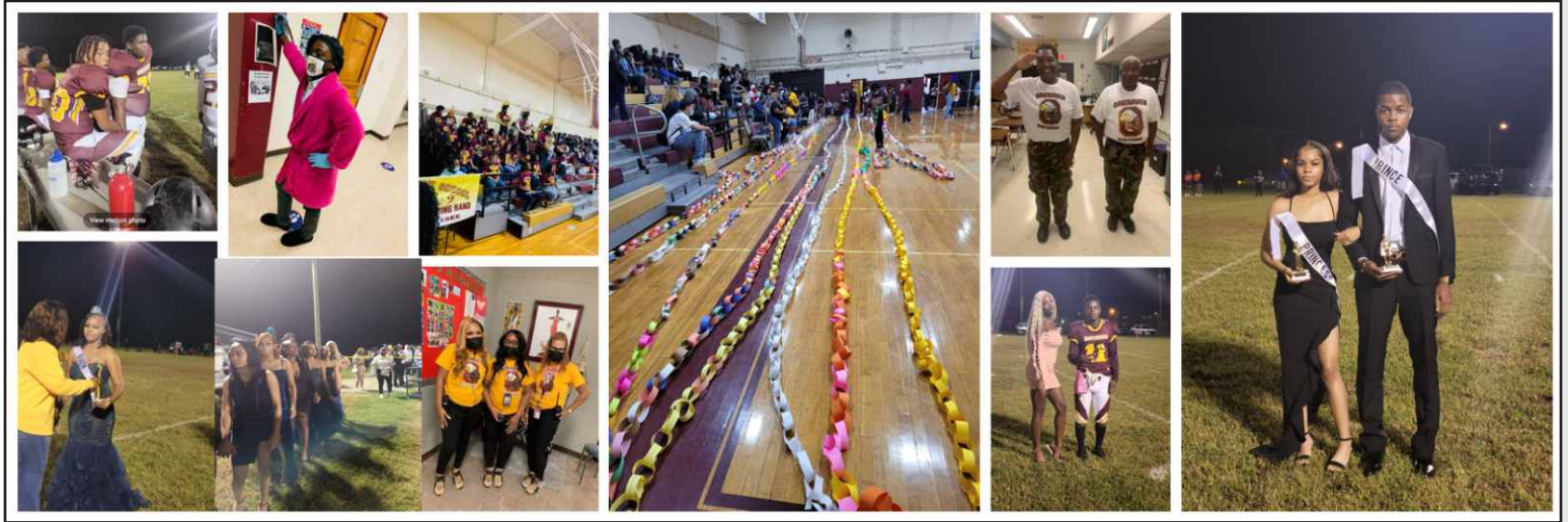
Football homecoming for Oakhaven High 2021 is in the books!

Senior Night is always bittersweet. This is the very last night these seniors will ever play or cheer in the Oakhaven stadium as an Oakhaven Hawk.