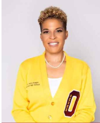
Admin Spotlight of the Month